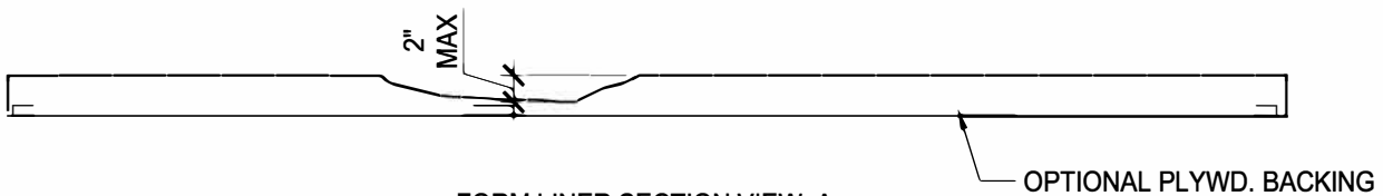
FORM LINER SECTION VIEW: A

NOTE: FORM LINER THICKNESS VARIES ACCORDING TO THE SIZE OF THE PANEL.